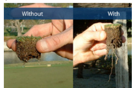
300% increase in root mass.

The irrigated water has had particle size reduction take place allowing the ions to pass quicker through the soils and not get caught up in the root zone for plants."