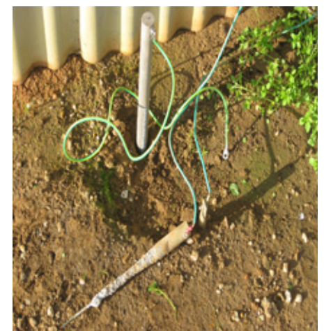
Corroded magnesium rod to be replaced - note: replacement rod not installed - placed for comparison only

On a recent visit from Care-Free, Dino said "We are so pleased we installed the Care-Frees...it would be much worse if we hadn't. We have significant reductions in EC and we're not getting leaf burn. But you must ensure you check the ground rods. I hadn't looked at them for some time and the magnesium rods had eaten away. Young Joe now has the job of making sure they're checked and replaced when needed so we get the best out of the conditioners."