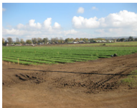
Rocket plantings Boratto Farm Bacchus Marsh

Seven years ago Dino installed a CF100 and CF75 on two spray irrigation systems used to grow mainly lettuce and spinach.