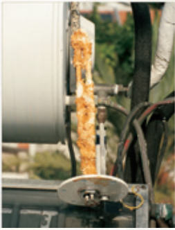
Calcium Carbonate in its hard-to-remove Calcite form