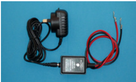
EK4 Power Regulator.

This serves as a reminder to inform your customers to regularly check their power regulators.